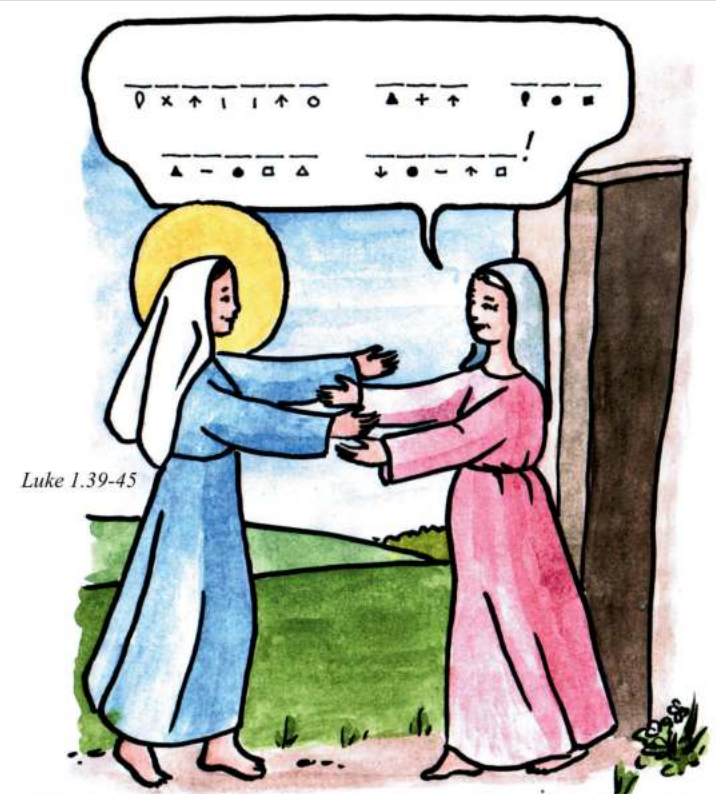
Elizabeth knew that Mary was the mother of the Messiah. What did she say to Mary when she came to visit her? Use the code to find out!

Answer to front page puzzle: Blessed are you among woment fraise: 1.true, 2.true, 3.false, 4.true, 2.true, 6.false, 7.true.