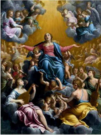
Reni, Guido. The Assumption of the Virgin Mary . Circa 1597.