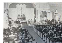
Church Interior circa 1968

Thanks to your previous generosity, our campaign has raised $1,933,977! We have achieved 74% of our $2,600,000 Challenge Goal. We need just over $600,000 more to reach this personal target! Since we have surpassed our WSWC parish goal, we now receive 75% of the monies raised. We are striving to have 1,000 families participate, so, please considering contributing if you have not done so already!