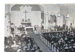
Church Interior circa 1968