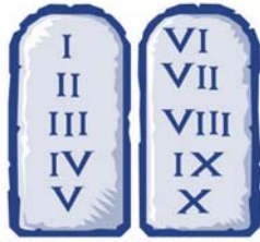
The Ten Commandments